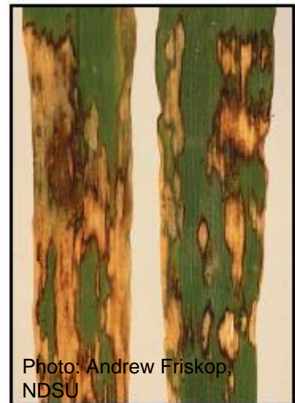
Figure 6. Scald ( Rhynchosporium secalis )