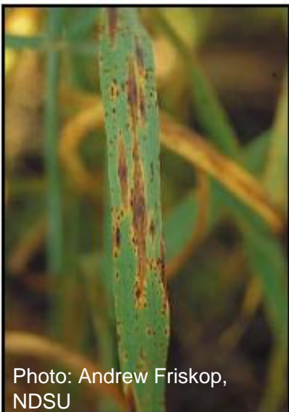
Figure 5. Spot blotch ( Bipolaris sorokiniana )