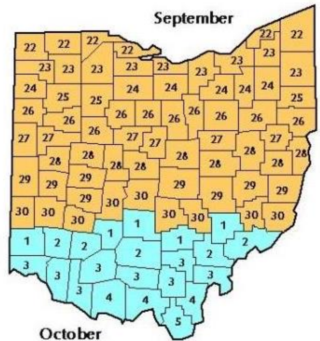
Figure 1. Hessian fly-safe dates for planting barley or wheat in Ohio counties.

Do not plant barley prior to the county Hessian fly-safe date (Figure 1). The fly-safe date coincides with reduced numbers of adult aphids, which transmit Barley Yellow Dwarf Virus to seedlings in the fall. The best time for seeding is the 10-date period starting the day after the fly-safe date. If freezing weather is delayed until late November or early December, planting three to four weeks after the fly-free date has been successful.