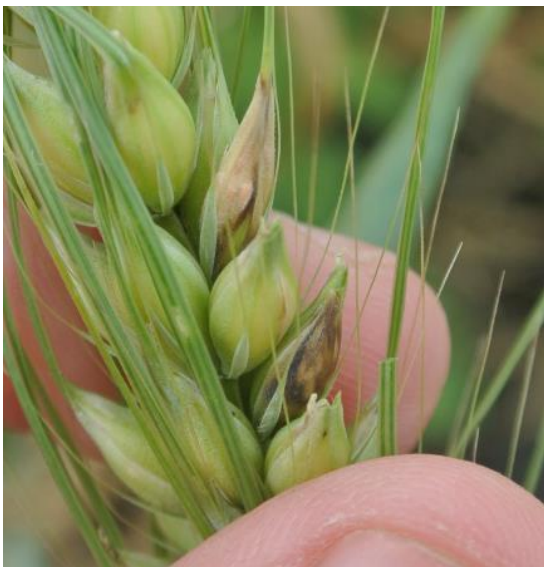
Figure 8. Fusarium head blight ( Fusarium graminearum ) on malting barley.

At best, winter malting barley varieties are moderately resistant to FHB. Two-row barley tends to be more resistant than six-row barley. Fungicide efficacy is good (not great) with application timing being extremely important.